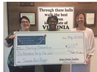
Spring 2015 Grant winners for the Sterling ES Summer Book Buggy program

This fall, the Foundation will give a total of $20,000 to fund innovative classroom projects in all grade levels. The 2015 Fall grant application is available now on our website. Completed applications must be received by Friday, October 23rd. Thank you to Claude Moore Charitable Foundation for supporting our teachers grant program with a $10,000 "Making a Difference" grant. Apply now