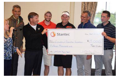
Title Sponsor Stantec presents check for $15K to LEF

teachers of Loudoun County Public Schools. The event is the Foundation's premiere fundraiser and proceeds go directly toward teacher grants, scholarships, STEM grants, the Senior Art Show, Regional Science and Engineering Fair, professional development for teachers and much more. Thank you to all of our event sponsors and participants!